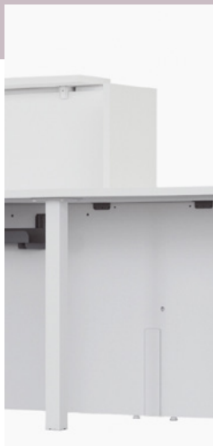
Support square leg at the junction of the tops and connection kit of modules