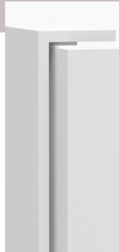
Nitech® reception shelf with elegant 45° mitre cut for visitors