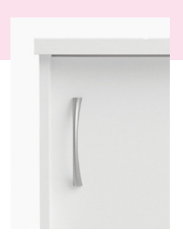
Ergonomic metal handle as standard feature on the storage units