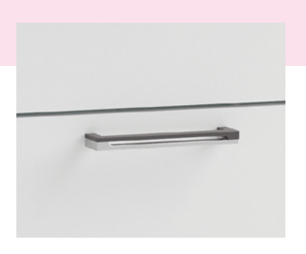
Elegant two-material brushed metal soft touch handle