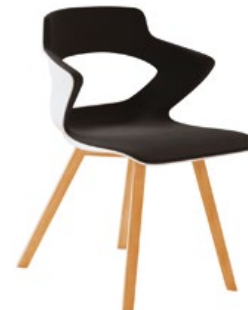
Yumi armchair with wooden legs