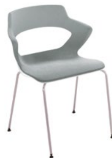
Nami armchair with metal legs